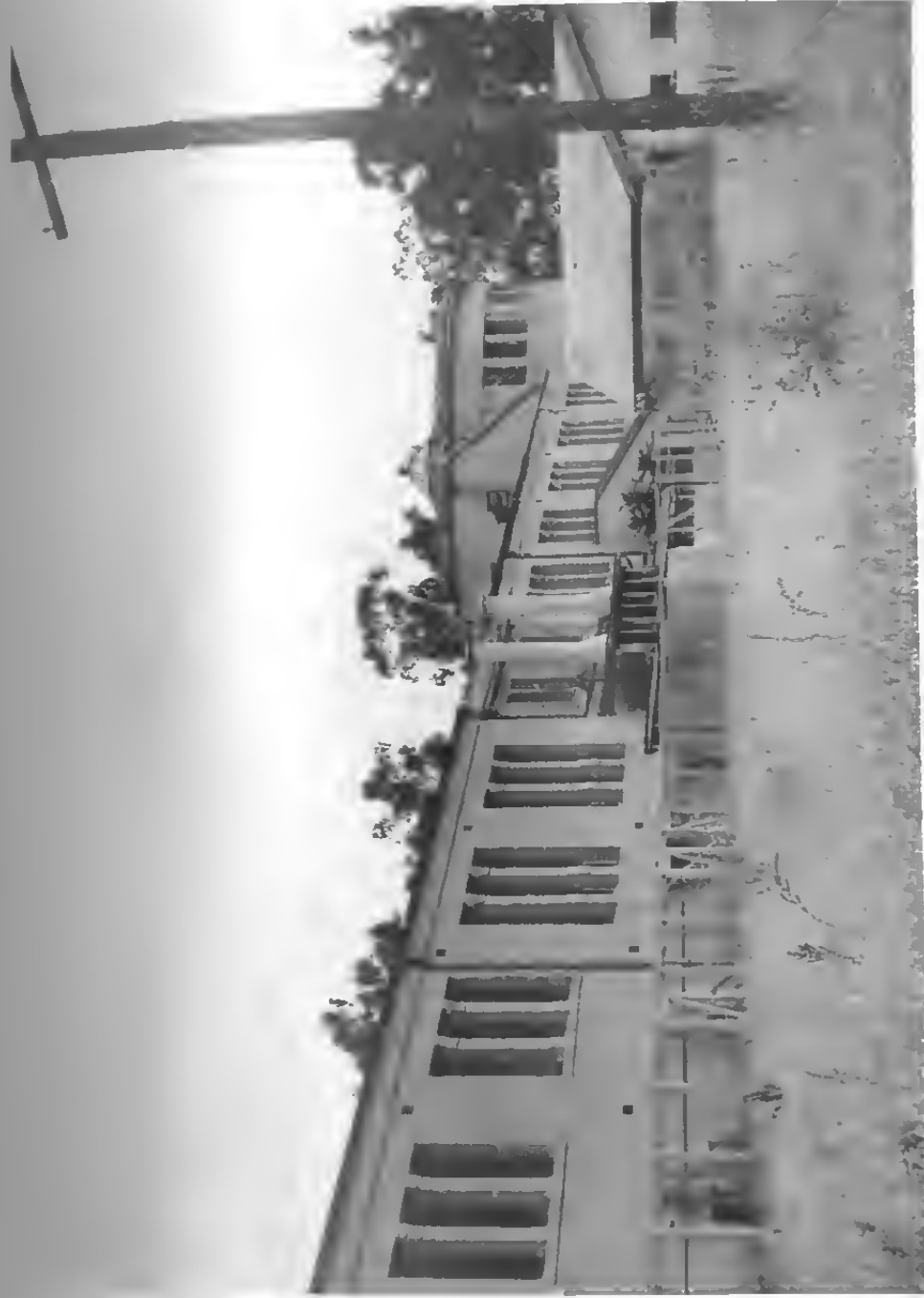
Anatomy And Bacteriology Laboratories On The Stanford Campus